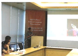
Korean Language Presentation