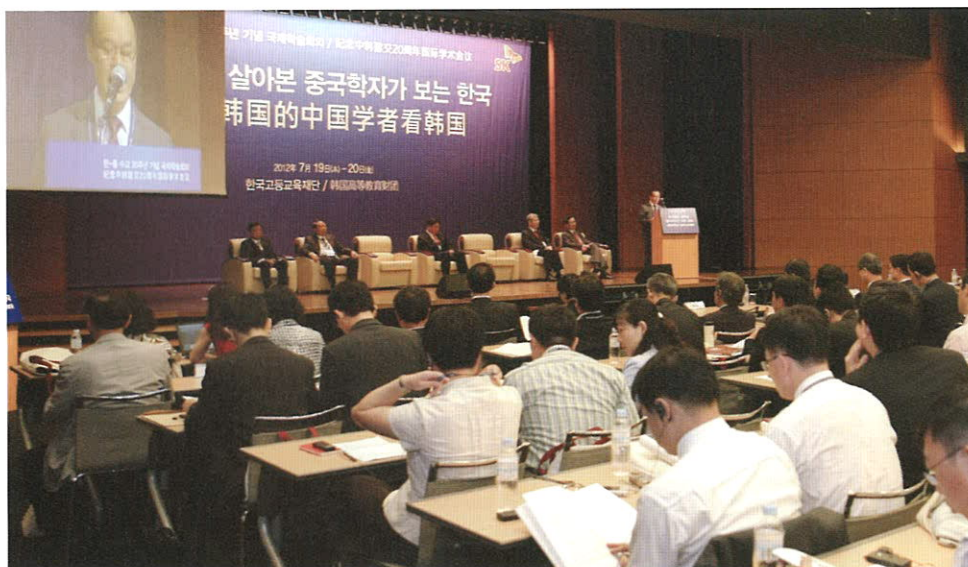
International Conference Commemorating 20 Years of Korea-China Diplomatic Relations