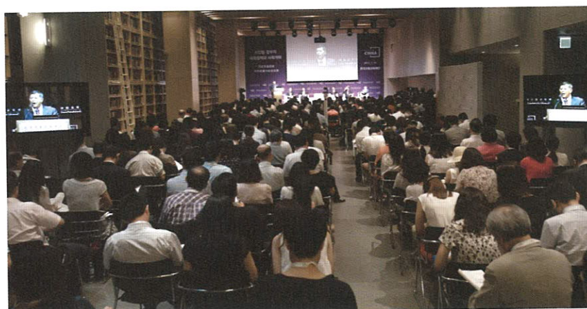
KFAS Conference Hall