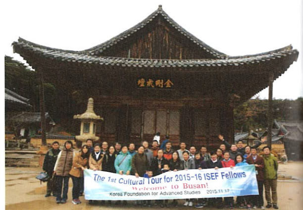
First Cultural Tour for 2015-2016 ISEF Fellows

Asia Research Center Room No. 504, 5th FL, Headquarter Bld. 144 Xuan Thuy Rd., Cau Giay District Hanoi, Vietnam T. 844-37547987 E. arc@vnu.edu.vn