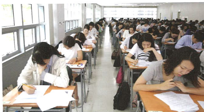
Scholarship Program Exam