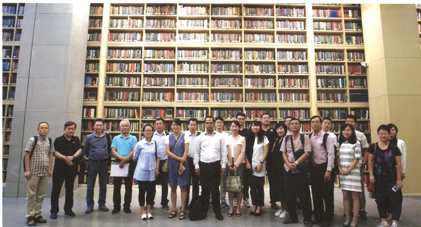
2016-2017 ISEF Fellows in the Conference Hall, upon arrival at KFAS

KFAS invites prominent scholars from Asia and the Middle