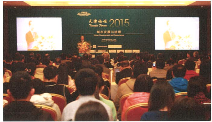
2015 Tianjin Forum