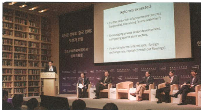
Understanding China Conference