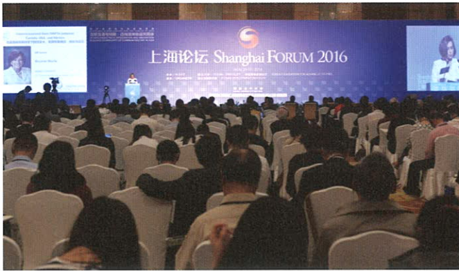
2016 Shanghai Forum