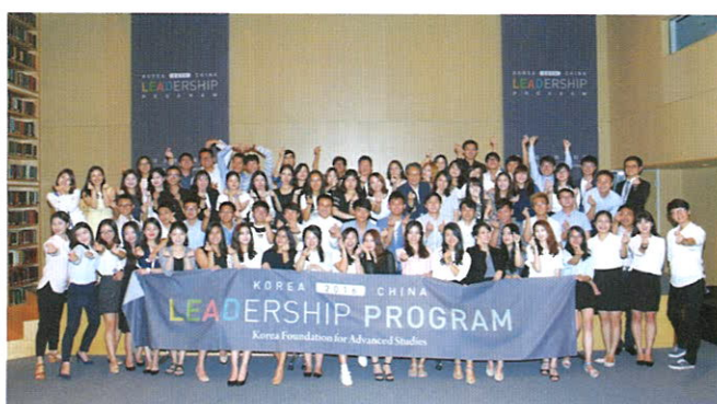
Korea-China LEADership Program

alumni who are prominent university professors and researchers have volunteered their services as of now.