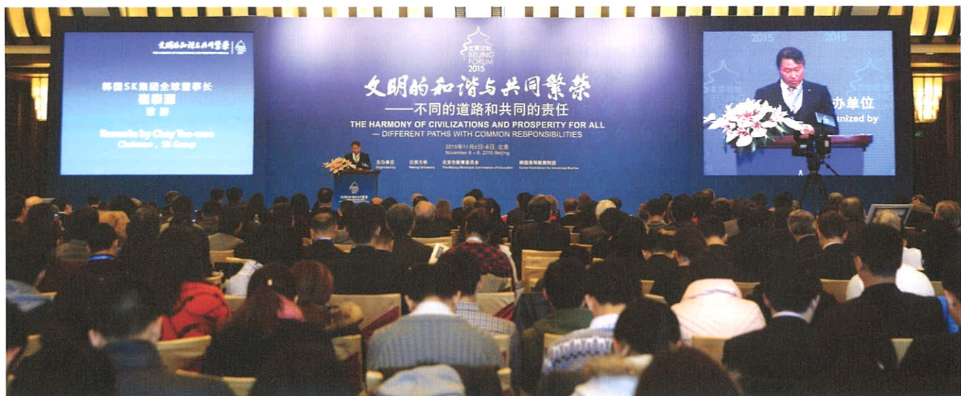
2015 Beijing Forum

The International Conference on Southeast Asian Cultural Values has been co-hosted annually by KFAS and the Royal Academy of Cambodia (RAC) since 2005. Over the years, the conference has focused on the following critical themes: "Preservation and Promotion of Culture" (2005), "Exchange and Cooperation" (2006), "Pro-