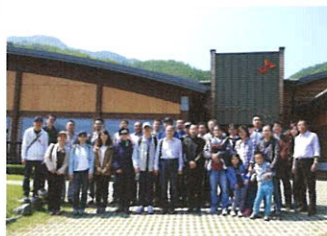
Visit to Afforestation Plant