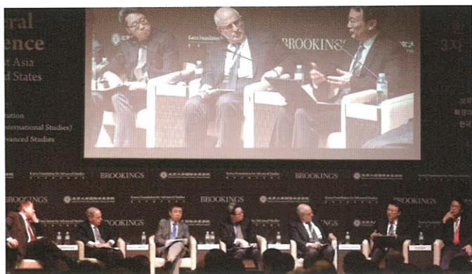
China-US-ROK Trilateral Conference