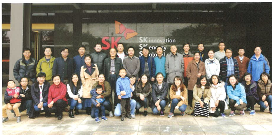
SK Energy Ulsan Complex Visit