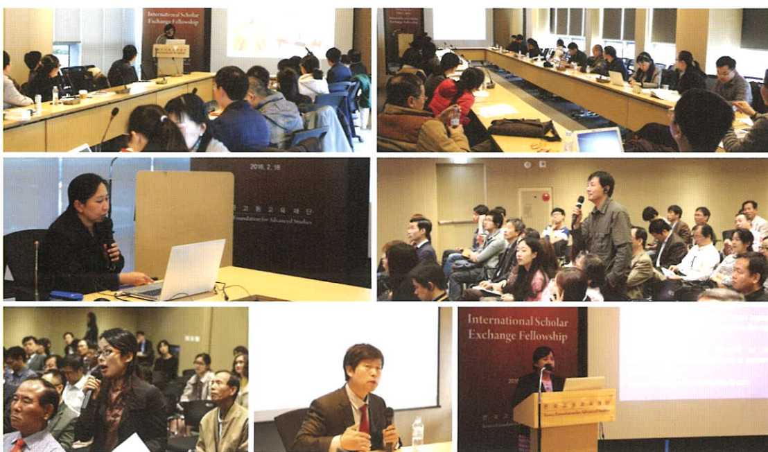
Academic seminars by ISEF fellows

dations. You may download the form at the KFAS homepage. ("Community" → "Download" → "Letter of Recommendation.doc")