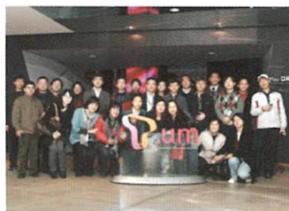
Visit to Industrial Site