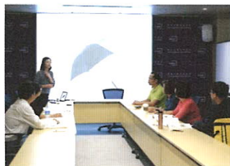
Korean Language Class

International Scholar Exchange Fellowship _6