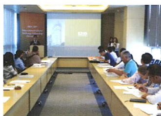
Orientation for the ISEF Fellows