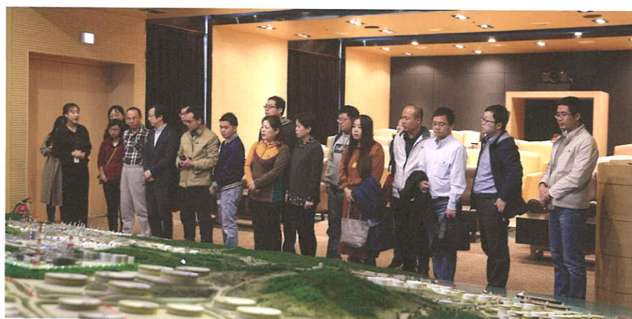
Visit to the SK Energy Ulsan Complex