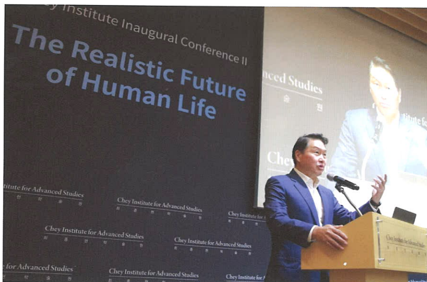
The Chey Institute Scientific Innovation Conference