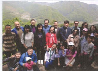
Visits to Afforestation Plant