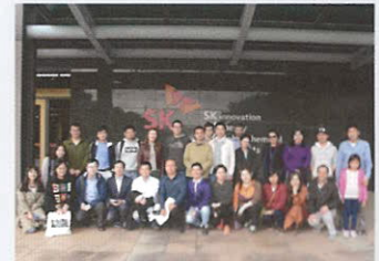
Visits to Industrial Site