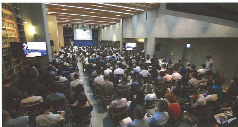
KFAS Conference Hall