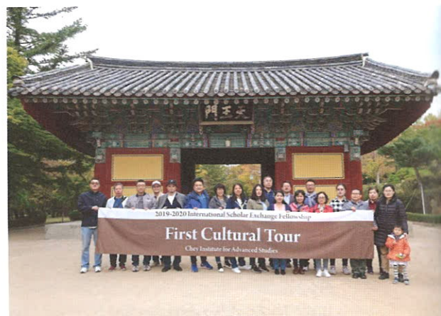
Cultural Tour for the 2019-2020 Fellows

Asia Research Center P.O. Box 11155-4563, 14174, Tehran, Iran T. 98-21-61112185 E. arc@ut.ac.ir