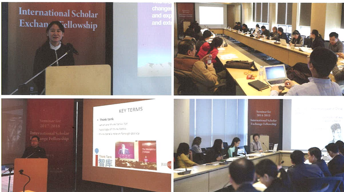
Academic seminars by ISEF fellows

appropriate Korean institutions and scholars immediately to arrange your research affiliation. You should send the Chey Institute a letter of research affiliation as soon as arrangements are made.