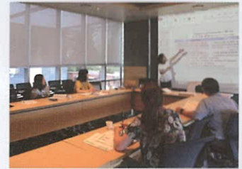
Korean Language Classes