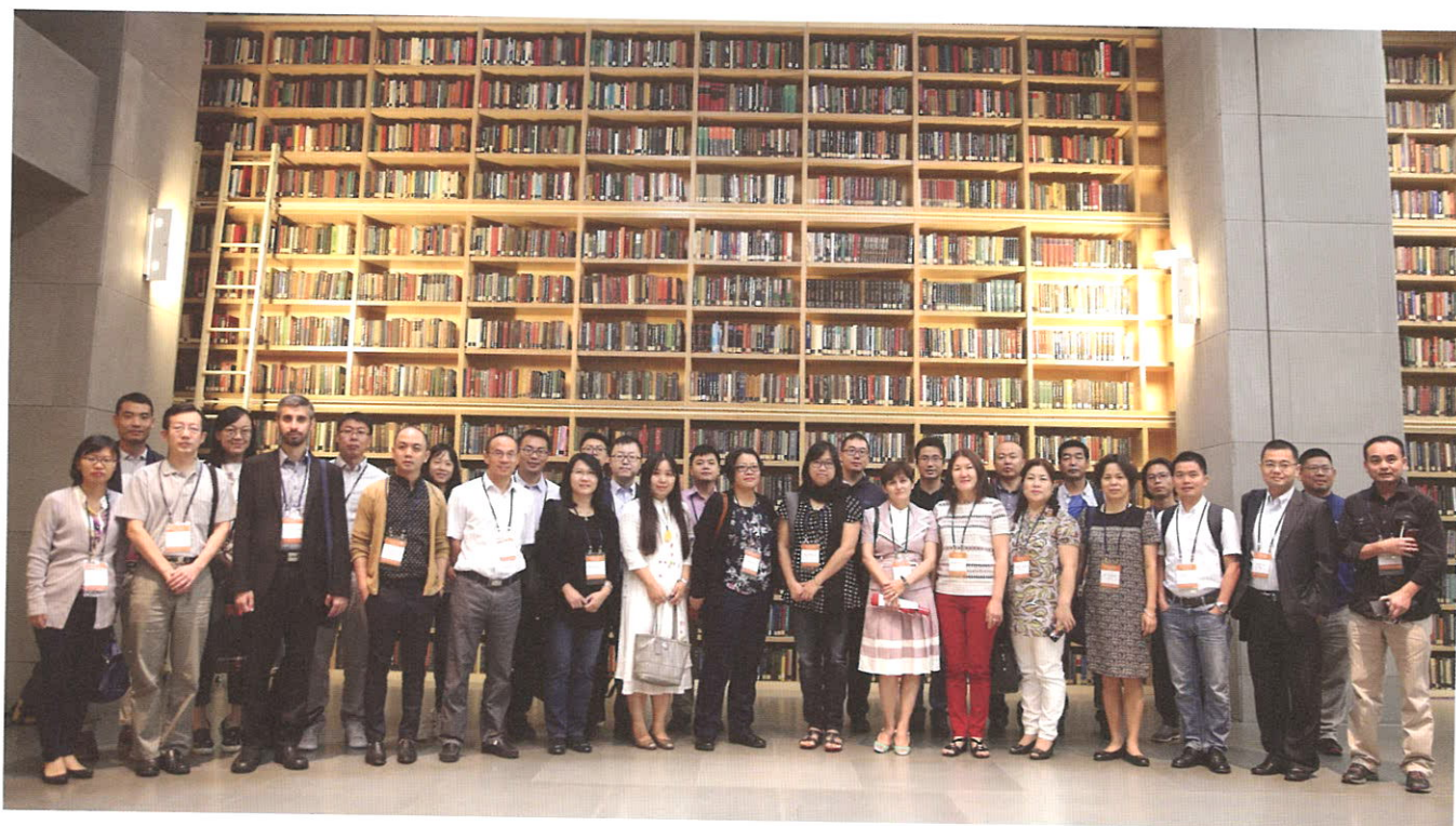
Arrival of ISEF Fellows

The ISEF program provides outstanding scholars with comprehensive research expenses during their stay in Korea, which include round-trip airfare, settlement support, a monthly research stipend, research grant and medical insurance. During their stay in Korea, fellows enjoy full access to the Chey Institute's facilities including seminar rooms and