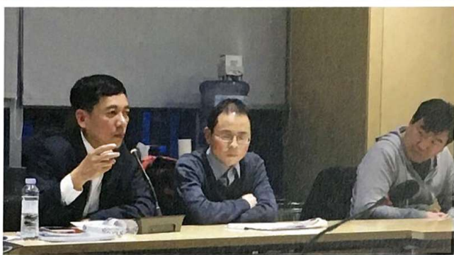
Academic seminars by ISEF fellows

dations. You may download the form at the KFAS homepage. ("Community"→"Download"→"Letter of Recommendation.doc")