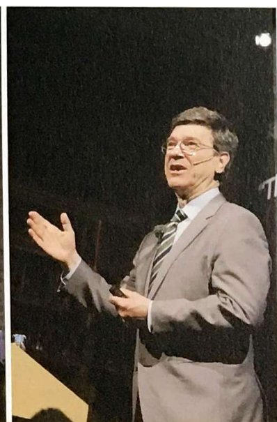
Special Lecture by Prof. Jeffrey D. Sachs