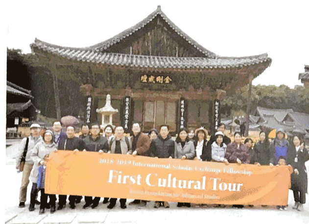
First Cultural Tour for 2018-2019 ISEF Fellows

Asia Research Center P.O. Box 11155-4563, 14174, Tehran, Iran T. 98-21-61112185 E. arc@ut.ac.ir