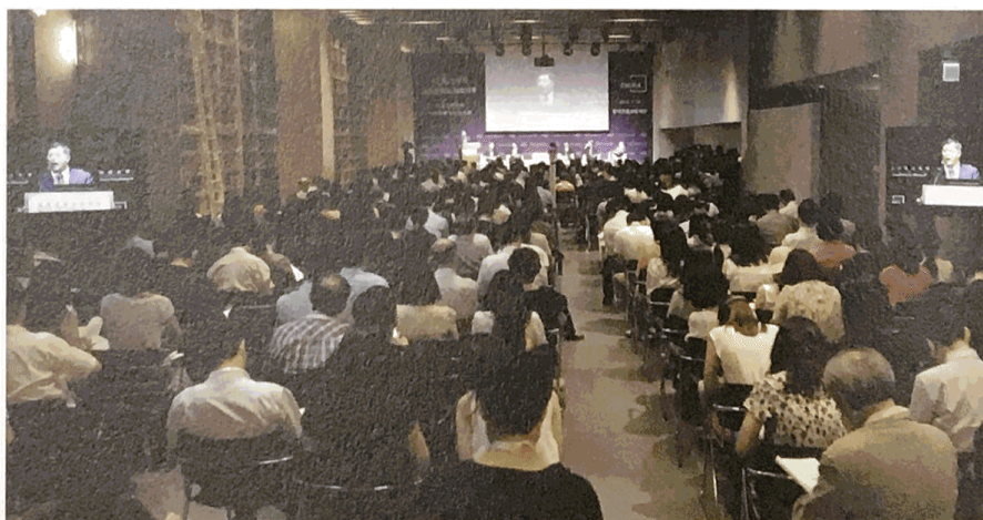
KFAS Conference Hall