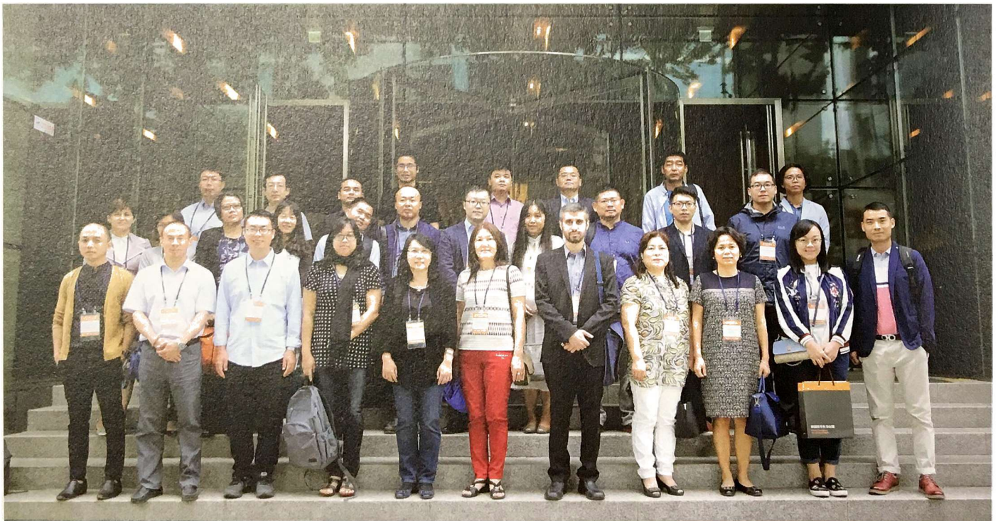
Arrival of ISEF Fellows

The ISEF program provides outstanding scholars with comprehensive research expenses during their stay in Korea, which include round-trip airfare, initial settlement support, a monthly research stipend, research paper publication support, and accident insurance. During their stay in Korea, fellows enjoy full access to CIAS facilities including the seminar rooms and library to help their research.