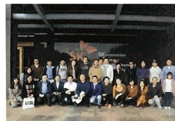
Visit to Industrial Site

Information of International Scholar Exchange Fellowship 2019-2020 _4