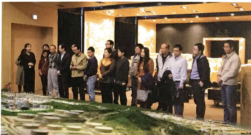
SK Energy Ulsan Complex Visit