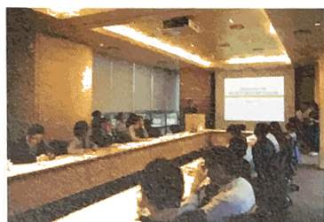
Orientation for the ISEF Fellows