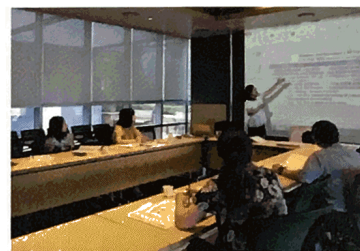
Korean Language Class

Introduction to Chey Institute for Advanced Studies _1