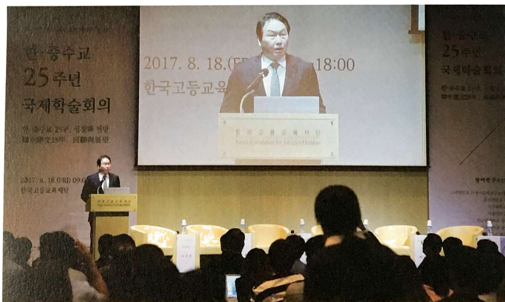
International Conference Commemoration 25 Years of Korea-China Diplomatic Relations